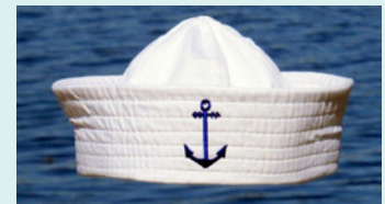
FIGURE OF EIGHT