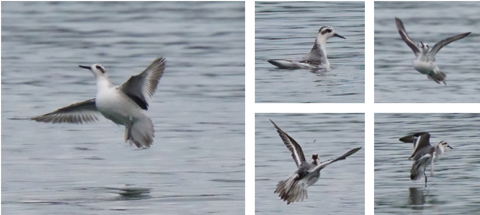
A rare sighting of the Red Phalarope on Lake Parsippany.