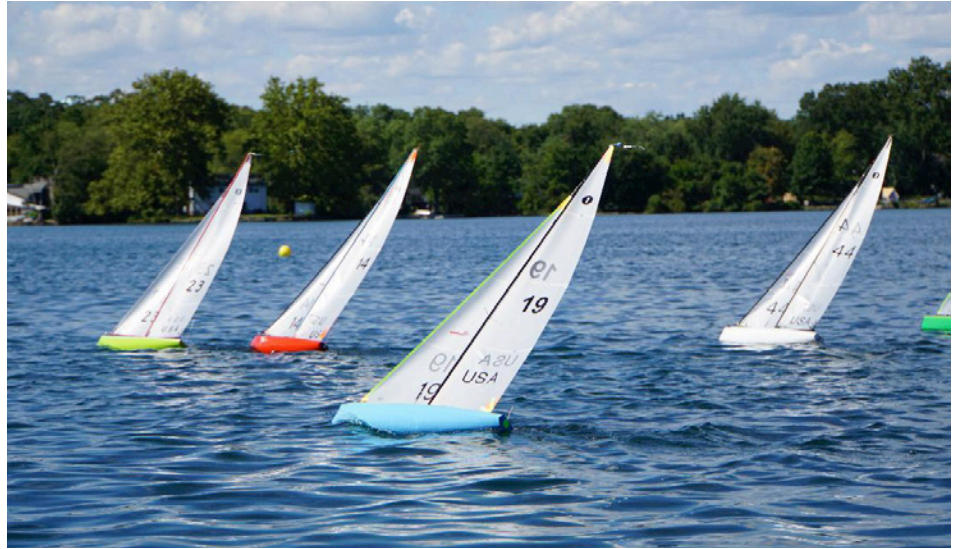
September 5th, nine boats responded to our (local only this year) invite for our Fifth Lake Parsippany Invitational Championship Regatta.