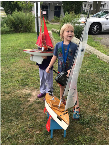
Do we have new RC sailing adepts or what? Grand kids have enjoyed their visit to Johnson Beach.