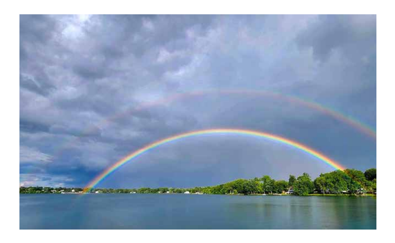
Let us unite our efforts for the betterment of all LPPOA members.

In conclusion, I want to emphasize that the LPPOA board members and volunteers are working collaboratively to enhance our community in various aspects, including beach operations, event planning, legal matters, and financial affairs. Over the past few years, our association has grown stronger, and it is vital that we continue this positive momentum by working together. Let us unite our efforts for the betterment of all LPPOA members.